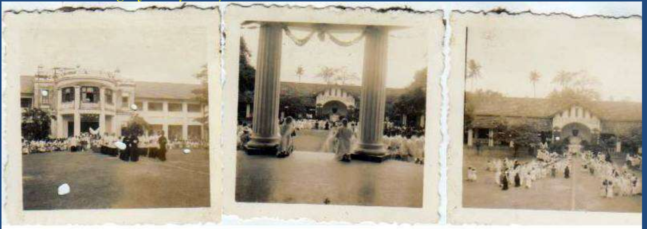
Corpus Christy (Circa 1930s)