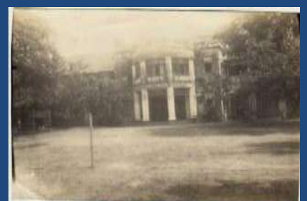
Quadrangle – 1930s