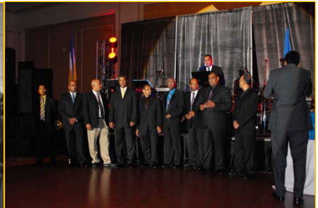
JPAA Committee stands in the foreground