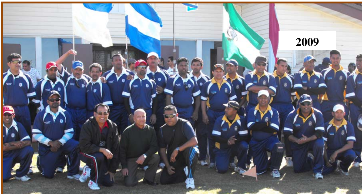
Saints Quadrangular 2009 – Josephian-Peterite Teams with the three presidents of JPAA Canada, SACKOBA, SBCOBA