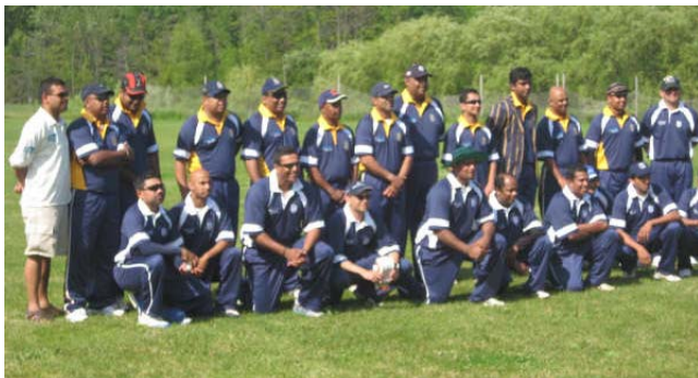
MAIN GAME TEAMS