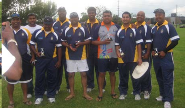
MAIN GAME PETERITE TEAM