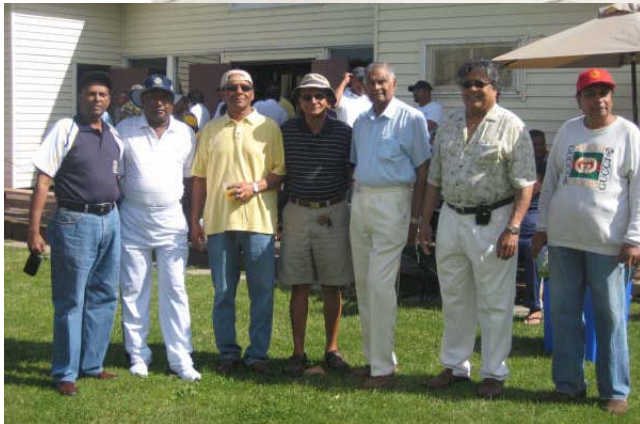
AD-HOC COMMITTEE 1984-1992