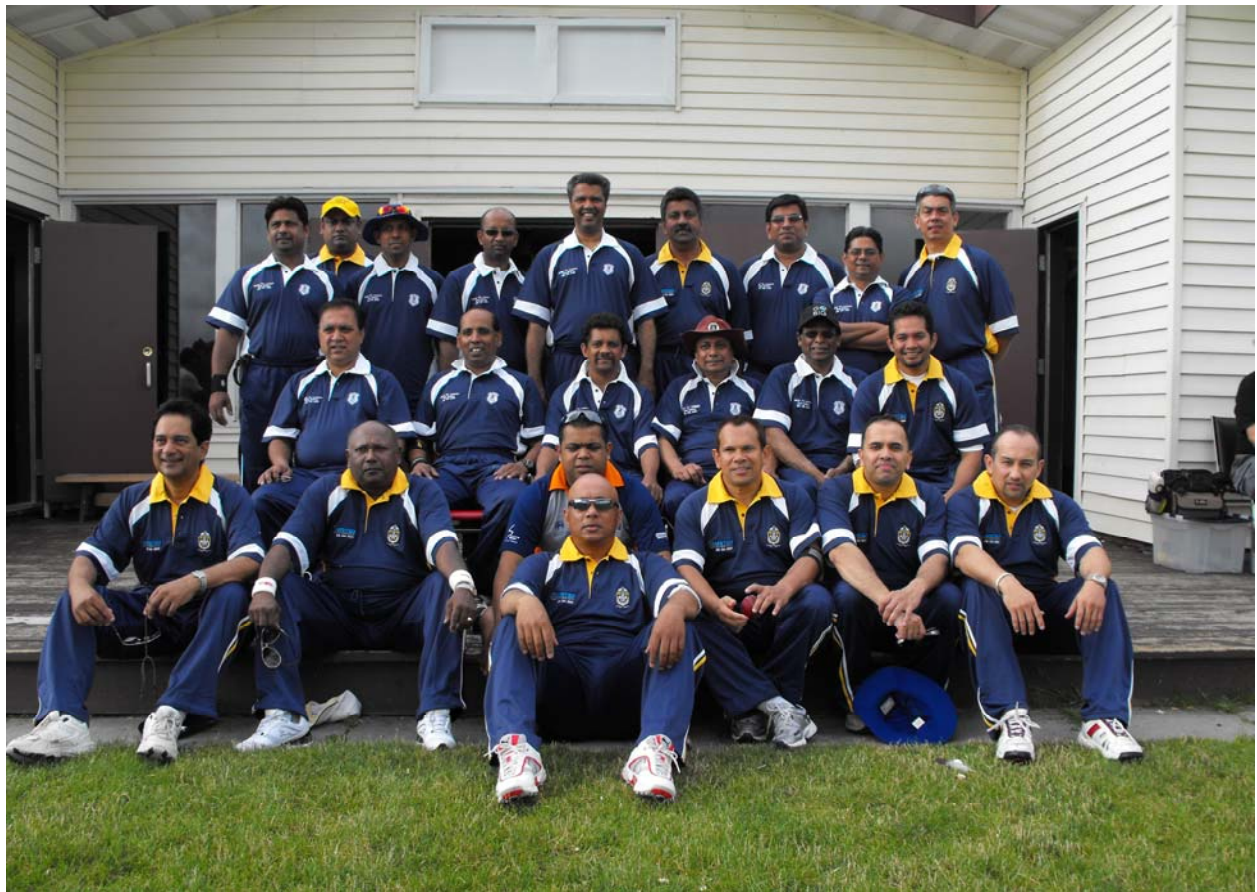
2009 MASTERS TOURNAMENT: JOSEPHIAN-PETERITE TEAMS