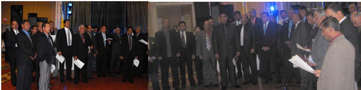
College anthems sung by old boys